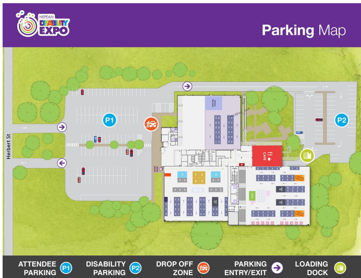
Figure 3: Nepean Event Parking Map

Please do not park in the venue car park during Expo days, this is strictly reserved for attendees only, unless you have a valid disability parking permit (P2).